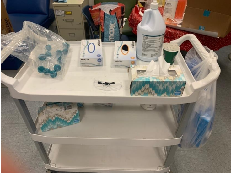
Here is our “Covid Testing To Go” cart. Gloves, extra gowns, goggle/face shield, plenty of tissue boxes, sanitizer wipes, hand sanitizer plus test tubes & swabs